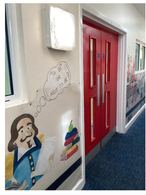
There is a trolley outside my classroom for lunchboxes and water bottles.